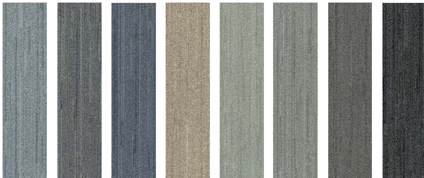
DEEPLINE-01 DEEPLINE-02 DEEPLINE-03 DEEPLINE-04 DEEPLINE-05 DEEPLINE-06 DEEPLINE-07 DEEPLINE-08